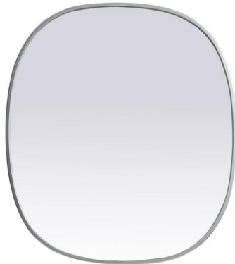
Item No:MR2B2430SIL (Silver)