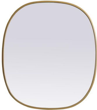
Item No:MR2B2430BRS (Brass)